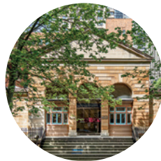
Justice & Police Museum