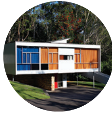
Rose Seidler House