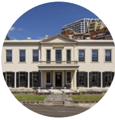
Elizabeth Bay House