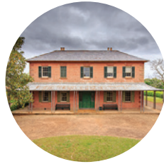
Rouse Hill House & Farm