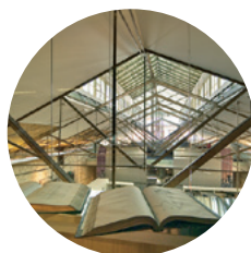
Caroline Simpson Library & Research Collection