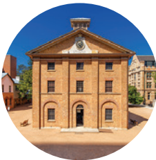
Hyde Park Barracks Museum