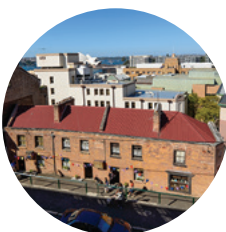
Susannah Place Museum